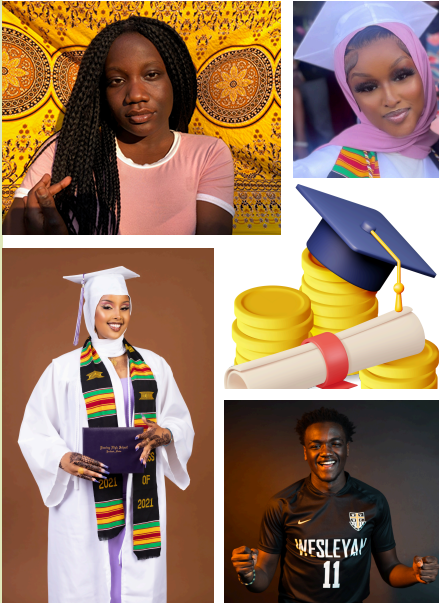
Former Scholarship Recipients

We know applying for scholarships can feel overwhelming. If you need help with your application, reach out to your local study center for guidance and support. And while you're thinking about scholarships, you're probably also thinking about financial aid. The financial aid process has changed and has become a bit trickier to navigate. If you need help understanding or completing your FAFSA applications, the study center staff are here to assist you. Be sure to read the application requirements! Take advantage of these opportunities and get the support you need to make your education dreams a reality!